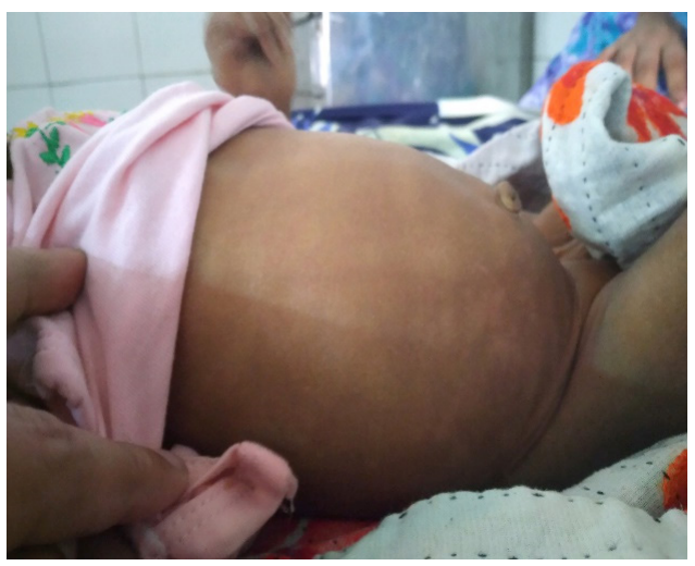
Figure 1. The patient's abdomen at admission