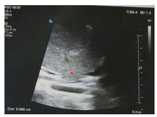
Figure 2. Doppler USG showing thrombus in proximal IVC (red arrow) at admission