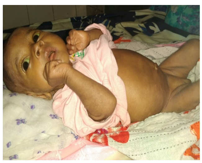
Figure 3. The patient after rivaroxaban